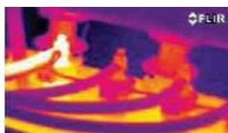
FLIR thermal image