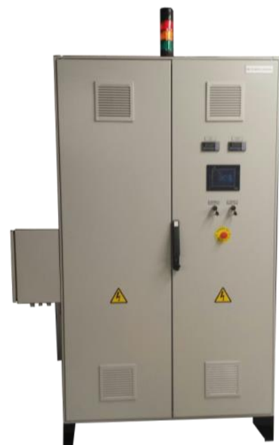
80kW continuous power cabinet