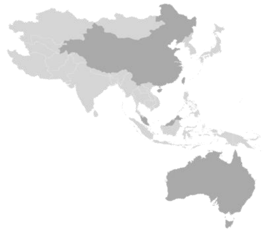
Asia / Oceania